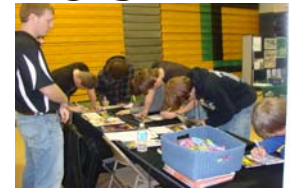
Columbus Regional Career Dream Team talk to students at the Columbus Career Fair about exciting careers in advanced manufacturing and related business.

In March alone we collected over 250 Capture Cards, presented to over 300 students, gave students manufacturing tours, did hands-on activities, etc.