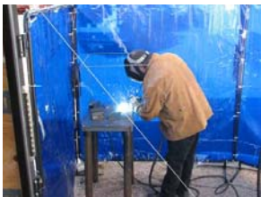
A hands-on welding demo provided by Central Community College—Grand Island at the Dawson Area Career Fair.

Last month Dream it. Do it. spoke with hundreds of students about the exciting, good paying careers in advanced manufacturing and related businesses.