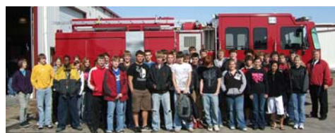
Smeal Fire Apparatus Co. hosts a plant tour to the sophomore and junior classes from Scribner-Snyer High School.